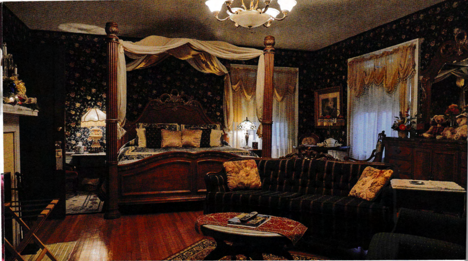
The McNeill Suite at McNeill Stone Mansion Bed and Breakfast.