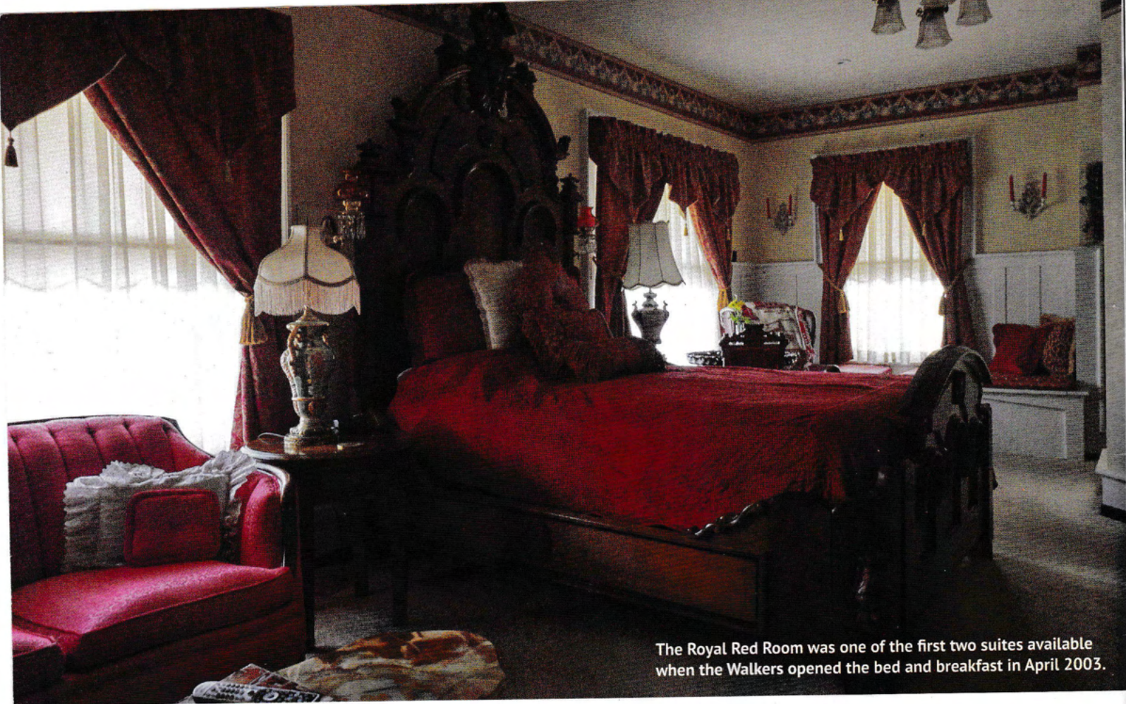
The Royal Red Room was one of the first two suites available when the Walkers opened the bed and breakfast in April 2003.